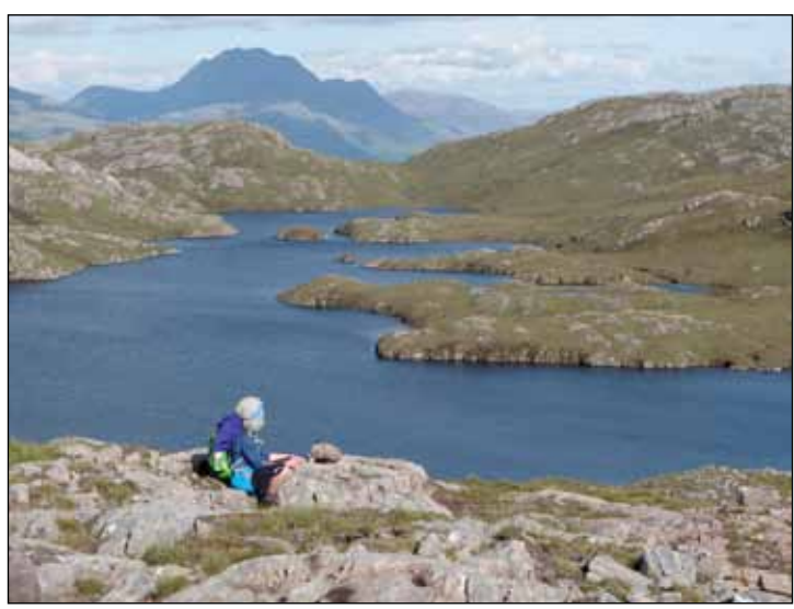
Slioch and Loch na Feithe Mugaig

needed care and took us to the path and a last mile to the road.