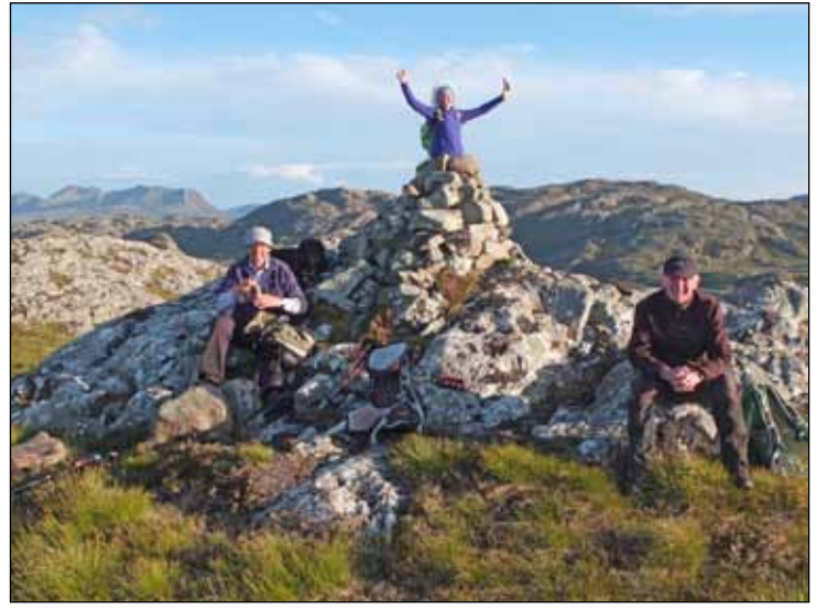
We made it! Creag Mhor Thollaidh

Now the end was in sight: a formidable-looking final hill, Creag Mhor Thollaidh (343m), also known as Tollie Rock. We reached the Slattadale path at a lochan guarded by a noisy greenshank, climbed a grassy angle up the side of the hill, and finally reached our tenth and last Mini. Triumph! (But we forgot to bring the champagne.) The final descent of a rough grassy gully