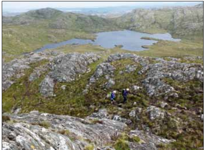
Loch Airigh a' Phuill and Meallan Mhic Aonghais (left) from An Groban

We dropped down to the Flowerdale hydro track, the only built path we encountered until the Tollie-Slattadale path at the end. One of our party, who had planned on only doing the first three, went down to Flowerdale from here. The remaining four of us, plus dog, crossed the burn and took the small worn path