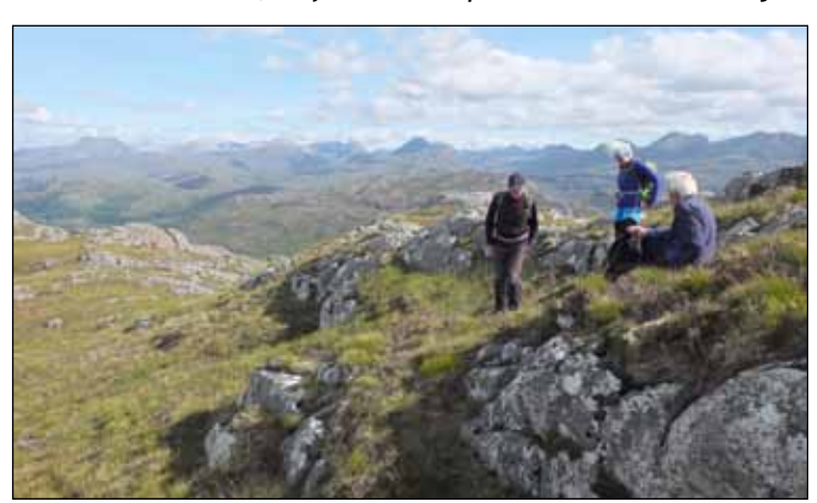
The Torridon skyline from Meall Glac Airigh an-t-Saoir